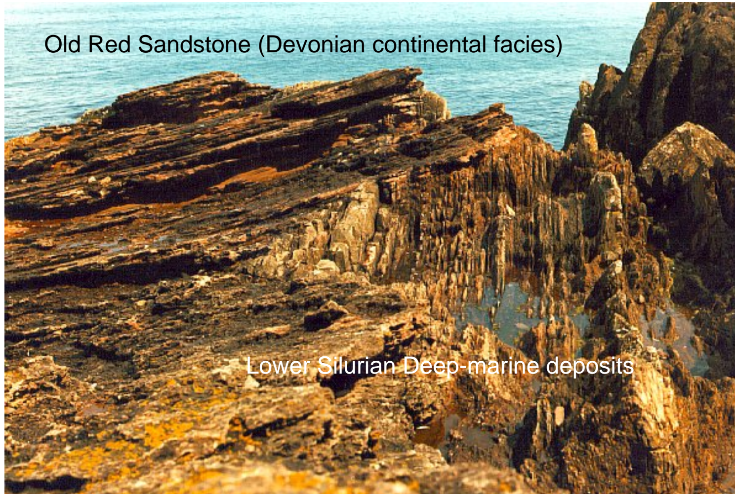
Siccar Point, Scotland